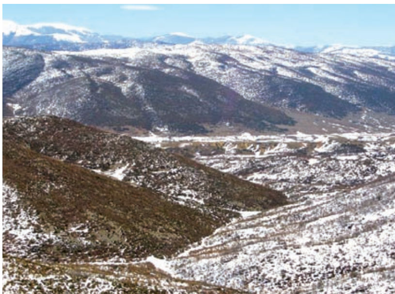
Mountain pass to Greece from South-east Albania. Throughout the early and mid-1990s, small groups of young males walked for several days, sometimes the whole length of Albania, before crossing the border clandestinely via mountain paths in remote places like this one.

Remittances — particularly from abroad — have been one of the most important aspects of this migration, not only for individuals and households, but also for the country as a whole. Reports from the Central Bank of Albania on total annual sums indicate that between 1992 and 2003, remittances rose from US$200 million to US$800 million annually. World Bank figures indicate that remittances totalled $1.48 billion in 2007. Representing between 10 and 22