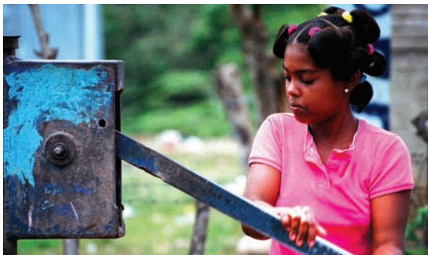
Girl fetching water near Las Placetas. Poor public services continue to limit local economic development and to overburden girls and women.

The majority of remittances sent by independent migrant women support parents and siblings; the latter, who depend only in part on the remittances, generally receive less money. These represent the largest percentage of investments in activities that allow economic independence for women. In-kind remittances, such as clothing for sale or personal use, involve a considerable investment from the