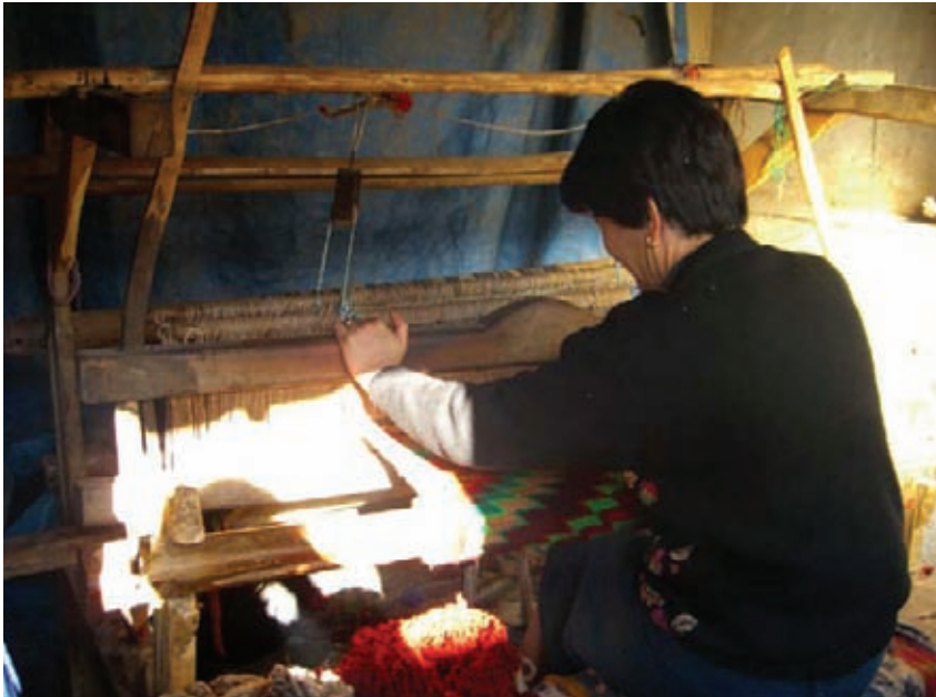
Albanian women who remain in the villages perform many productive and reproductive tasks. Here, a woman in pojan is shown weaving.

percent of the country's GDP, they have surpassed the amount of foreign direct investment, as well as the amount of aid received from international institutions. In 2004, remittances amounted to more than twice the revenue from exports. At the household level, remittances have been crucial to economic survival and poverty alleviation, and have ensured a necessary supply of capital for small businesses. However, very little attention has been paid so far to the intra-household and country-wide gender aspects of these significant monetary transfers.