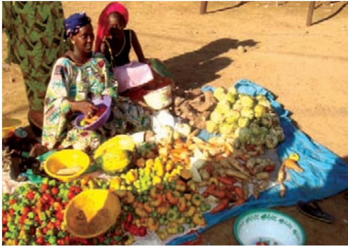
In Fouta, women seeking income-generating activities sell fuelwood or vegetables they have grown.