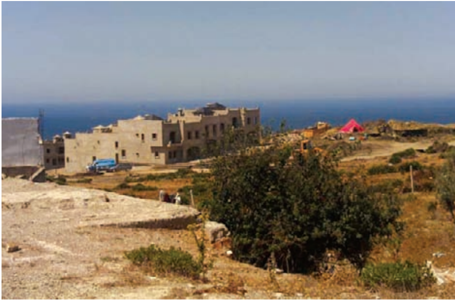
Bahraouiine, a rural Moroccan community, was one of the case study sites.

Like other women, Moroccans, upon becoming immigrants in Spain, tend to work in the service industry, mostly in domestic service (17 percent), hotels (19 percent), retail (19 percent), with the remaining 45 percent employed in other sectors. De-skilling is common, as Moroccan women often find themselves in employment sectors different from the ones available to them in their country. Unlike in Spain, the dominant industry for Moroccan women is factory work. Yet unlike other groups, Moroccan women are not as concentrated in areas of domestic work. In fact, the Moroccan socio-cultural model contributes to the low insertion of women in domestic work, since it often requires that they reside within employer households, which neither the women themselves nor their partners accept.