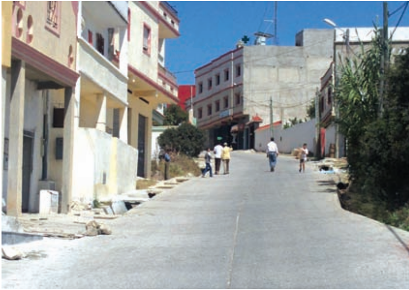
Bahraouyine: remittances are utilized to cover household needs for construction or renovations of a home.

used to maintain other adult family members who require assistance (e.g., due to unemployment, excessive number of children, or illness).