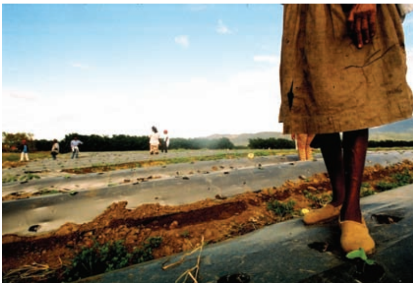
Wives who remain in the Dominican Republic tend to be overburdened with tasks: managing the household, caring for family members, attending to subsistence agriculture, and participating in social and community life.

It is important to note that the work niches available to women follow traditional gender patterns. Typical jobs