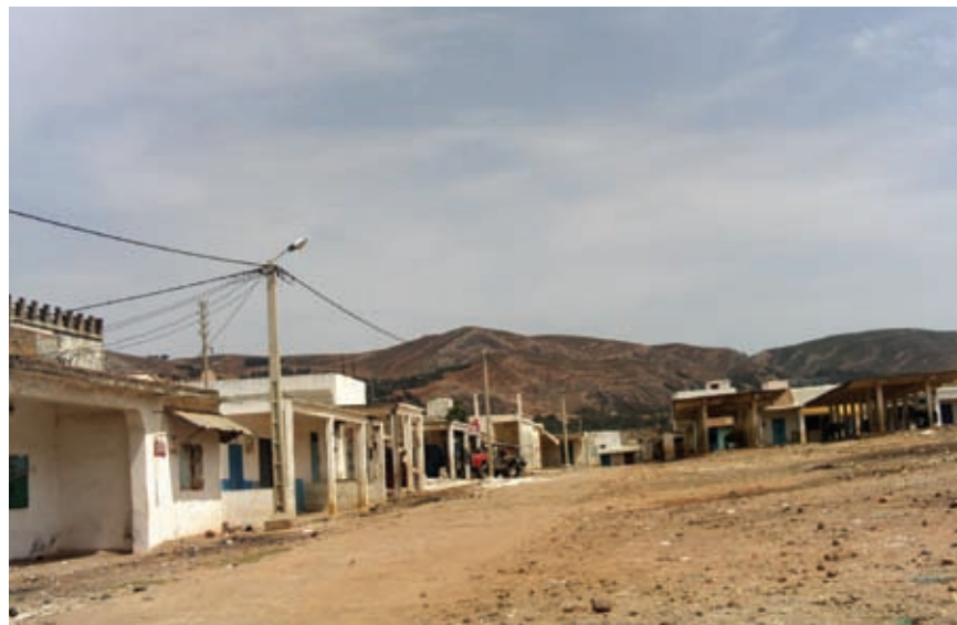
Beni Gorfet, a rural Moroccan community, was one of the case study sites.

The information collected confirms the results of other reports from the last three decades: remittances are utilized to cover household needs and construction or renovation of a home. They contribute to the satisfaction of basic needs and to improving the quality of life. In particular, remittances are mostly used to cover the costs of food, housing (e.g., electricity, rent), health and education, and specifically to attend to the needs of dependent family members (e.g., elder parents, those without pensions or health insurance, disabled siblings, and children). They are also