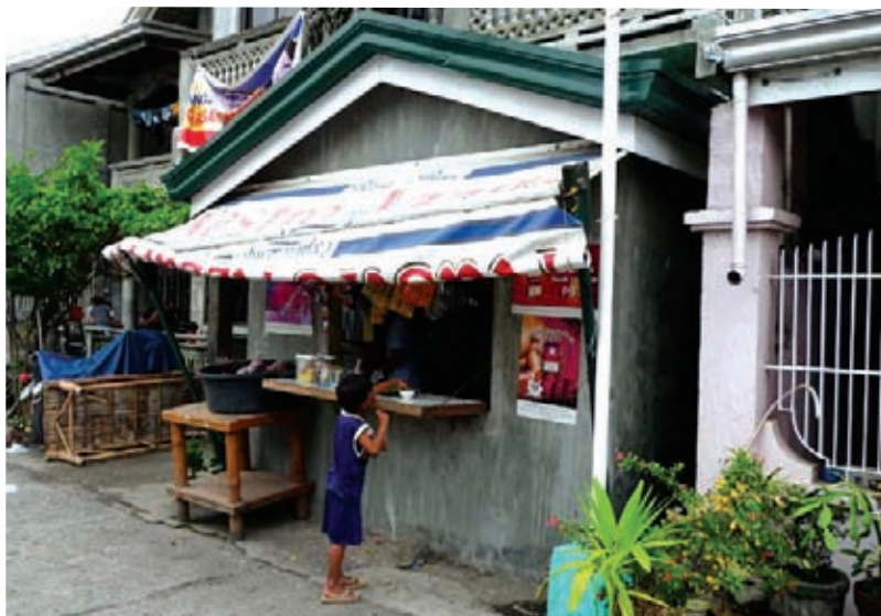
Some remittance recipient families run sari sari stores (neighborhood convenience stores), which are attached to or inside the shopkeeper's home.

As a major labour export country, the Philippines lacks sufficient bilateral agreements that address pensions and the rights and protection of migrant workers. Consequently, there is a need to develop return migration policies that address reintegration, financial investment, savings opportunities and education. Mechanisms and initiatives regarding migrant-specific policies, which particularly acknowledge the intersectional inequalities (based on factors such as gender, education, age and occupation) of migrants must be produced and implemented. A holistic approach migrants' needs on individual, household and community levels is a necessary prerequisite to addressing the joint contribution of migrant remittances and government involvement in sustainable development practices.